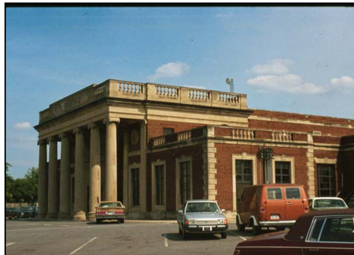
The 1927 J. Douglas Galyon Depot recently reopened. This picture was taken before the completion of the renovation.