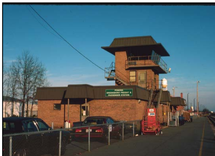
In 1979, Amtrak moved to a very small station at NS' Pamona Yard. The station on the far end of this facility would not hold more than 20 people and often required passengers to stand outside while waiting for the train.